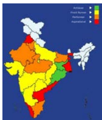
Major States FHI Heatmap NE & Himalayan States Heatmap